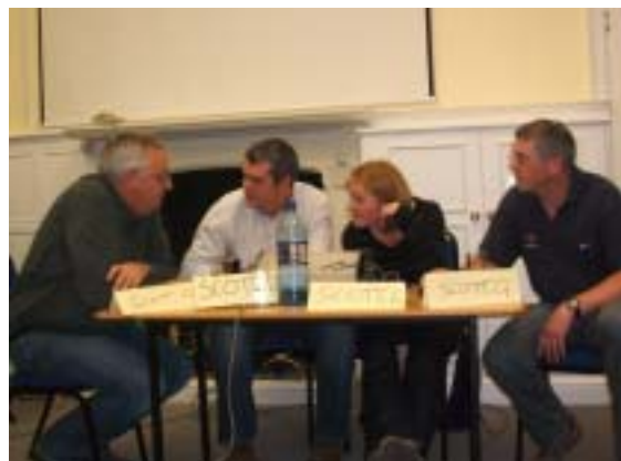
Neolithic People, College Students

For further information, please contact: