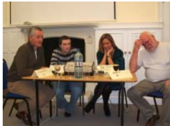
Just In Time, IBS Staff