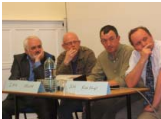
Dr Who + The Darlicks, College Staff