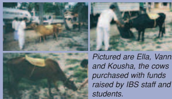
Pictured are Ella, Vanni and Kousha, the cows purchased with funds raised by IBS staff and students.

The staff and students of The IBS are continuing to raise funds for the Optima Foundation, with an additional £40 being raised through a Grand National Sweepstake and £80 from a raffle in May.